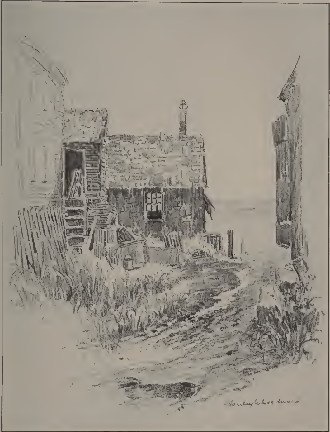
THE COVE, MARBLEHEAD